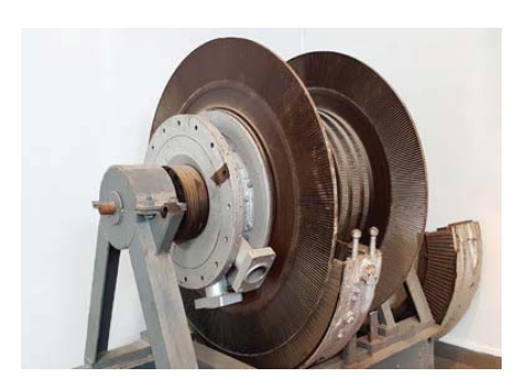
Figure 6 - Ljungström steam turbine, 1928