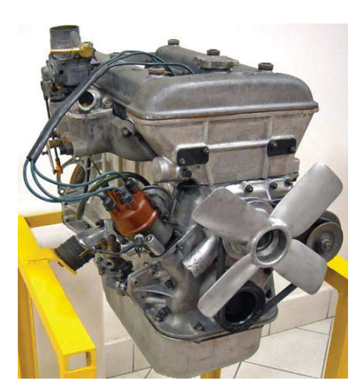
Figure 30 - Alfa Romeo type 00100 Bialbero 1300 engine, 1960