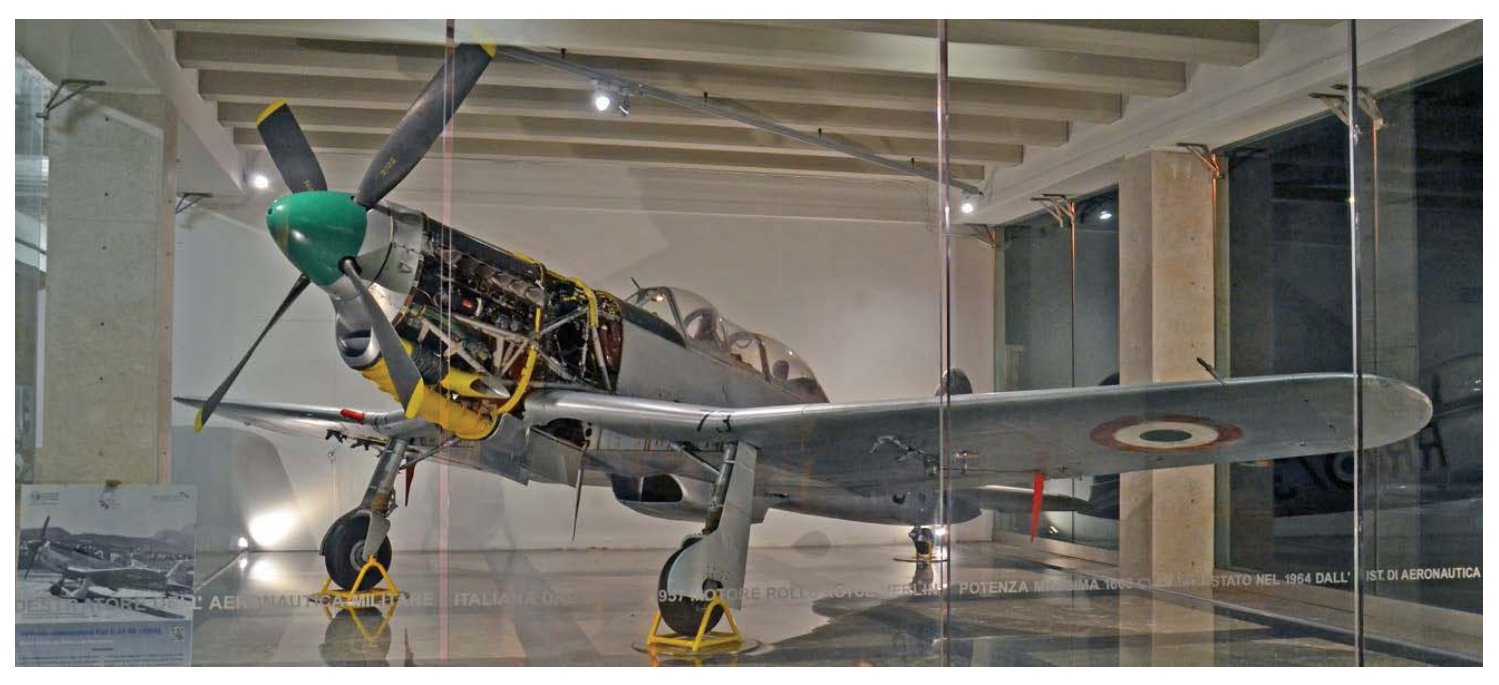
Figure 23 - FIAT G.59 4B trainer aircraft equipped with a Rolls Royce Merlin 500-20 engine, 1950

The collection includes piston engines designed for light aircrafts and helicopters produced after the Second World War: the most noteworthy are the unique prototype aero Guzzi V50, developed by Moto Guzzi in the 1970s for ultralight aircraft, and the Franklin 6A8 and the Franklin 6V4 (figure 25). both air-cooled boxer 6-cylinder engines developed at the end of the 40s, which well represent the typical arrangement widely used even nowadays for light aircraft piston engine. The Franklin 6A8 engine has been used over the years on seaplanes and light aircrafts, including the Piaggio P.136 and the Republic RC-3 Seabee. The Franklin 6V4, strictly derived from the 6A8 model, has a vertical cylinder block arrangement specifically designed for light helicopters such as the Bell 47.