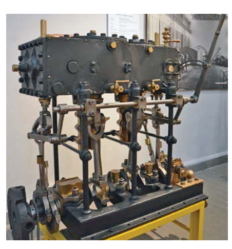
Figure 5 - Marine steam engine, ca. 1890