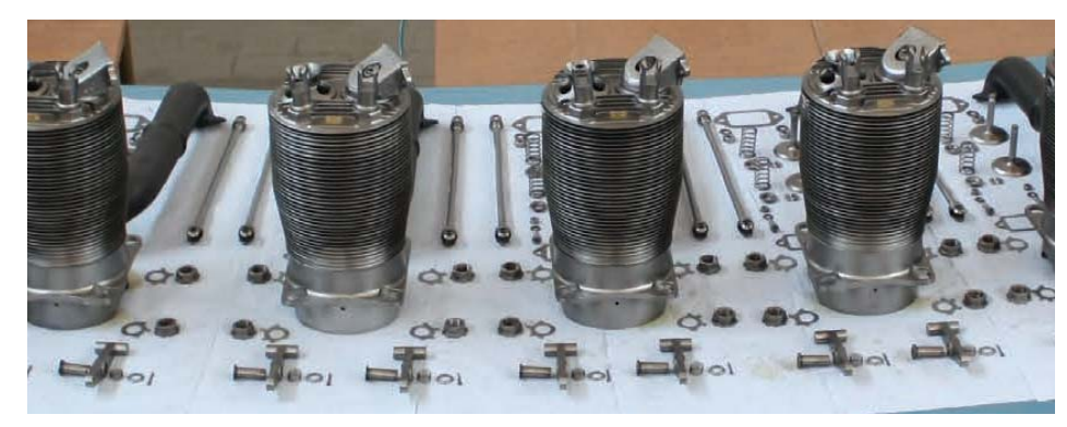
Figure 3 - Restoration activities