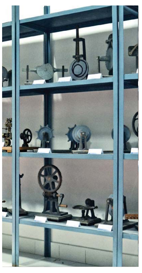
Figure 2 - A part of the instructional mechanisms collection