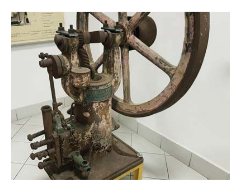
Figure 8 - Langen & Wolf petrol engine, ca. 1900

At the beginning of the twentieth century, the compression ignition engine, proposed by Rudolf Diesel in 1892, gradually came into use, at first, mainly in stationary and marine power plants. This engine type is well represented in the collection. The older ones date back to 1910-1920: the stationary single-cylinder, two-stroke DWK (Deutsche Werke Kiel) engine (figure 10); the four-stroke, single-cylinder Hille Werke engine (figure 11); and the single-cylinder, two-stroke HMG (Hanseatische Motoren Gesellschaft) engine (figure 12). The DWK engine was long used for research and instructional activities at the University of Palermo. For this reason, it is displayed together with its original Ranzi hydraulic brake, showing a typical experimental and instructional setup.