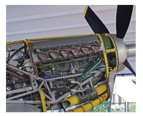
Figure 22 - Rolls Royce Merlin 500-20, 1950s