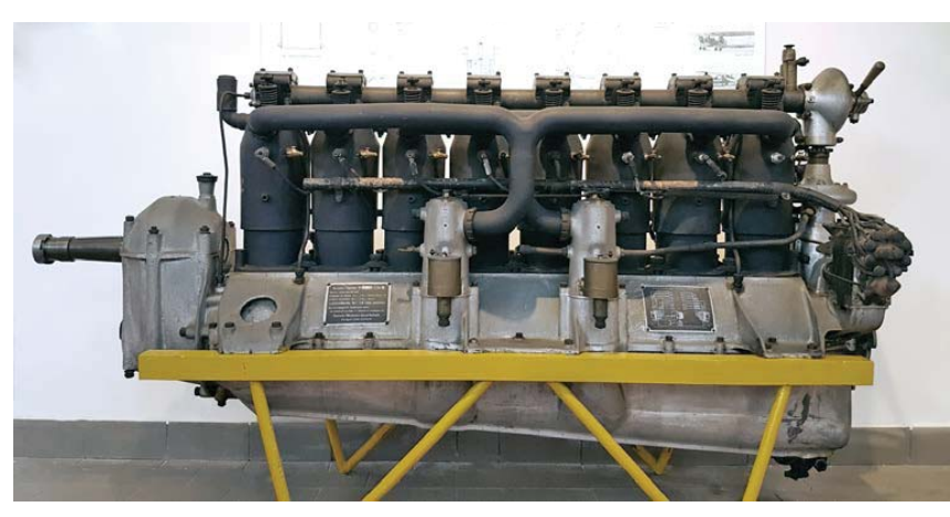
Figure 13 - Daimler Mercedes D.IV aircraft engine, 1916