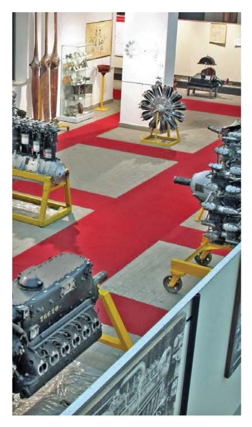
Figure 1 - Panoramic view of the Museum