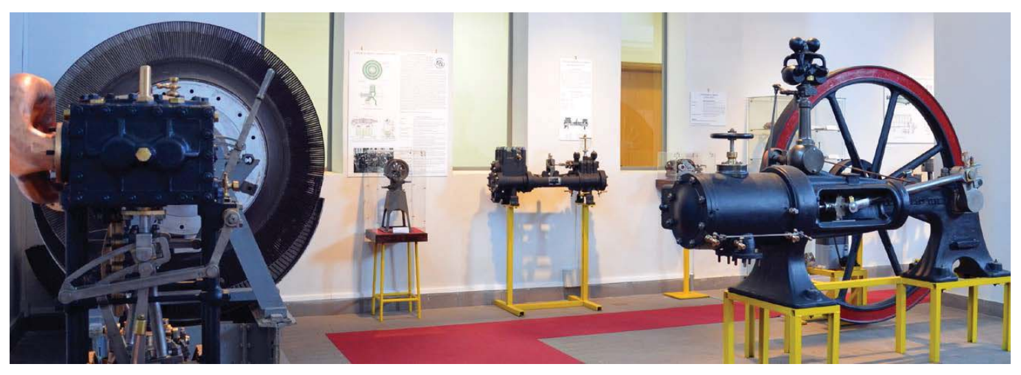
Figure 4 - Neville stationary steam engine, ca. 1880