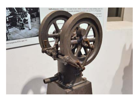
Figure 7 - Stationary Stirling engine, Louis Heinrich Maschinenfabrik, 1905